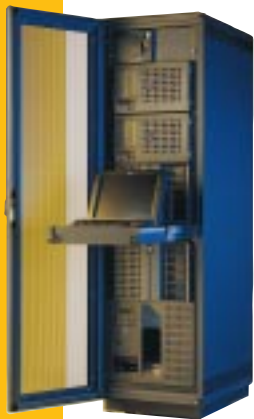
Dell PowerEdge® Servers and PowerVault® Storage Systems

F our months before the opening of one of the most expensive hotels in history, the IT department at Mirage Resorts, Incorporated was in a bind. They had already settled on the platforms they needed for the new Bellagio hotel, systems selected to help assure uptime and minimize the strain on their massive network. But what they wanted was the latest 4-way Intel® Xeon™ processor technology to help drive this network –